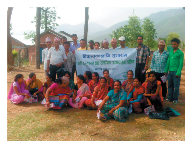
Participants of social accountability training program conducted by Human Welfare and Environment Protection Center in Dang

A total of 609 grievances were registered in the project planning department. Most of these complaints were related to demand for goods, services, or small projects. As such, the department decided to submit these demands as proposals in the next municipal council meeting. Based on some of the demands, eight water taps have been installed. As a result of awareness raising campaigns, citizens now have information about goods and services they are entitled to receive. Also, citizens are able to voice their grievances in the concerned department.