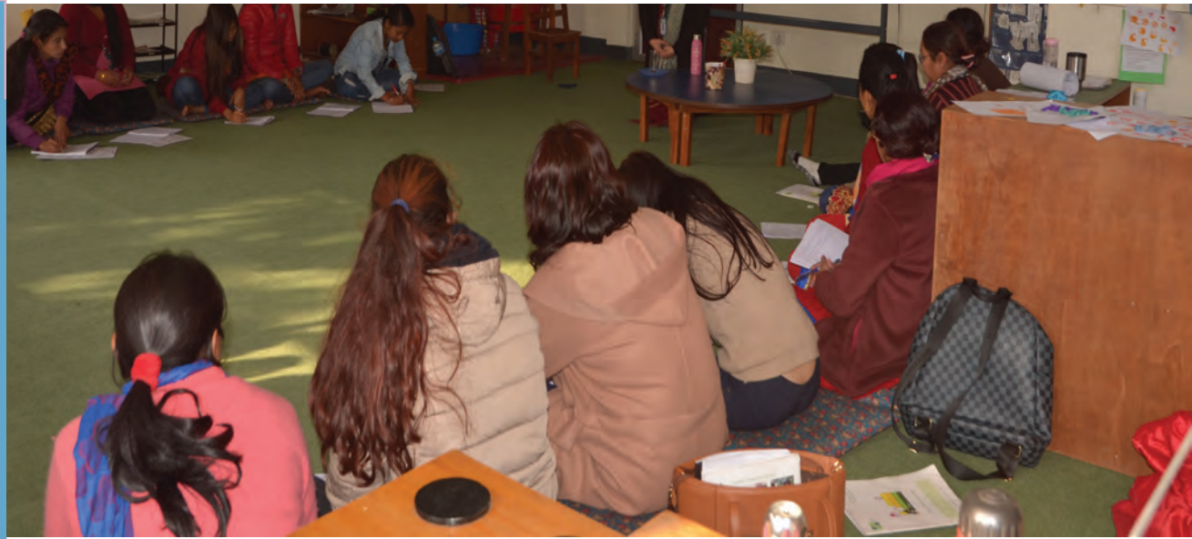
Montessori training participants

The Livelihood Promotion of Earthquake Affected Population of Nepal (PUNARNIRMAN) project, funded by Global Affairs Canada (GAC), has successfully provided Montessori training to 12 young women of Sindhupalchowk, Kavrepalanchowk and Lalitpur District. Montessori training