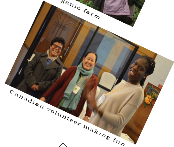
Canadian volunteer making fun