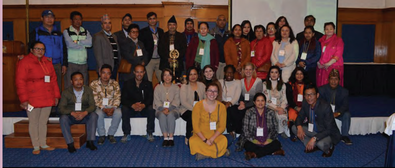
Uniterra team with Canadian volunteers

Annually CECI Nepal welcomes more than 50 Canadian and Australian volunteers in Nepal. This year Australian Volunteer Program (AVP) and Canadian Volunteer Cooperation (Uniterra) celebrated the International Volunteers' Day (IVD) on the 5th of December, 2018 to honour the contribution of volunteers in the social and economic development of Nepal.