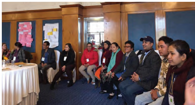
Canadian volunteers with representative of partner organizations