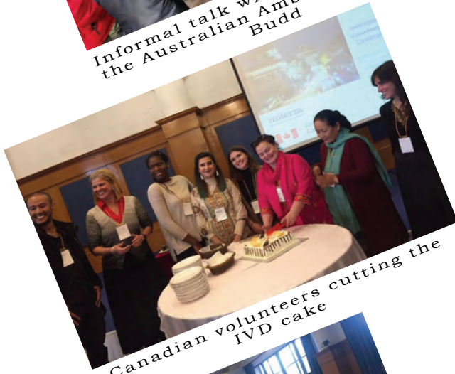
Canadian volunteers cutting the IVD cake