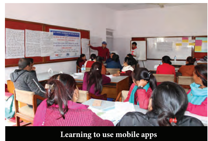
Learning to use mobile apps

S USASAN is also helping the municipalities increase development, test, implement and roll out new technological tools and platforms. These new tools and platforms include, Infrastructure Management System, Municipal Mobile Apps, IVR based messaging System, Grievance Redress Mechanism, Public Hearing Procedure, Electronic citizen charter.