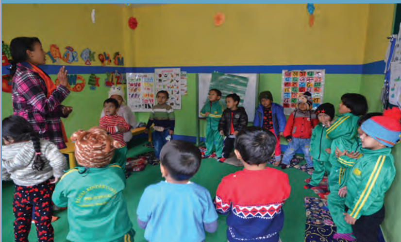
Practical session in the school

completed their college education and are looking forward to work in the primary schools in their own community, will utilize their technical knowledge on promoting the education system.