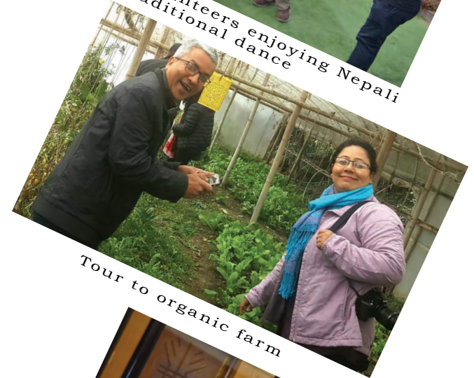
Tour to organic farm