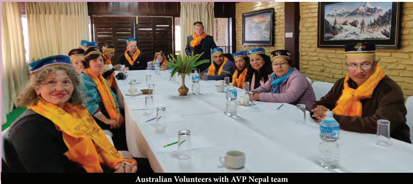
Australian Volunteers with AVP Nepal team

CECI manages both the Australian and Canadian Volunteer Cooperation Programs in Nepal with financial support from the Australian Government and Canadian Government respectively.