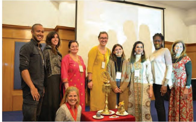
Canadian Volunteers in Nepal