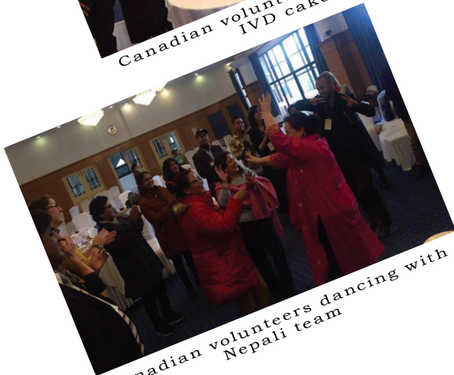
Canadian volunteers dancing with Nepali team