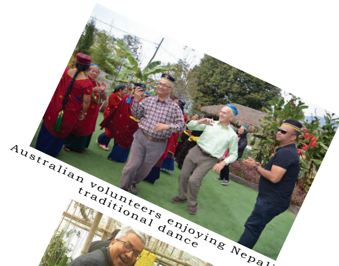
Australian volunteers enjoying Nepali traditional dance