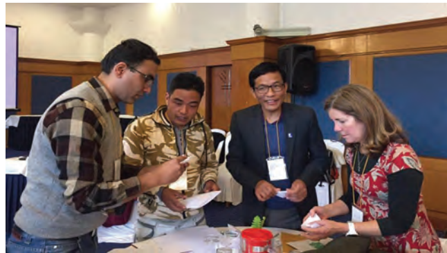
Team building exercise