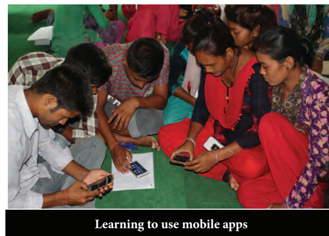
Learning to use mobile apps