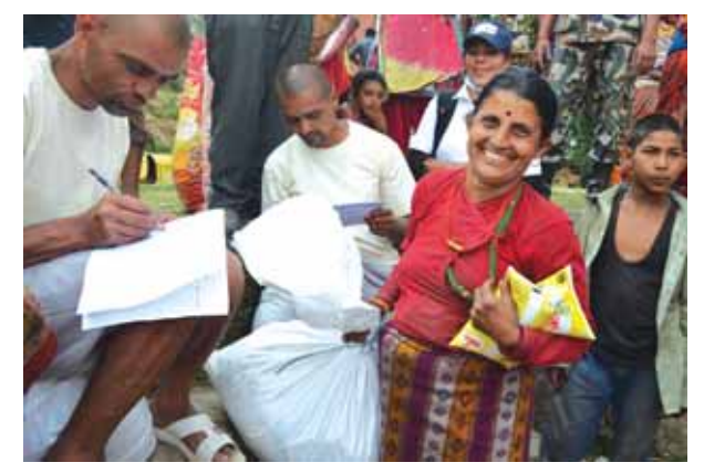
Distribution of food packets