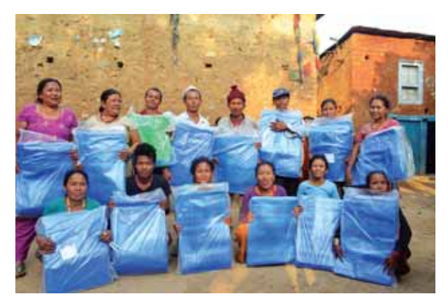
Tarpaulin distribution in Kavre