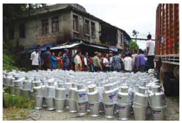
Distribution of dairy utensils

7.8 magnitude earthquake of April 25, 2015 followed by several aftershocks including a 7.3 magnitude on May 12 are Nepal's worst earthquakes in more than 80 years.