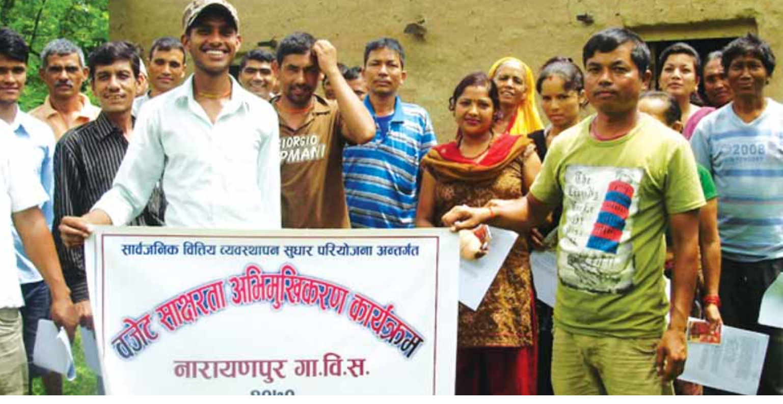
Budget literacy program