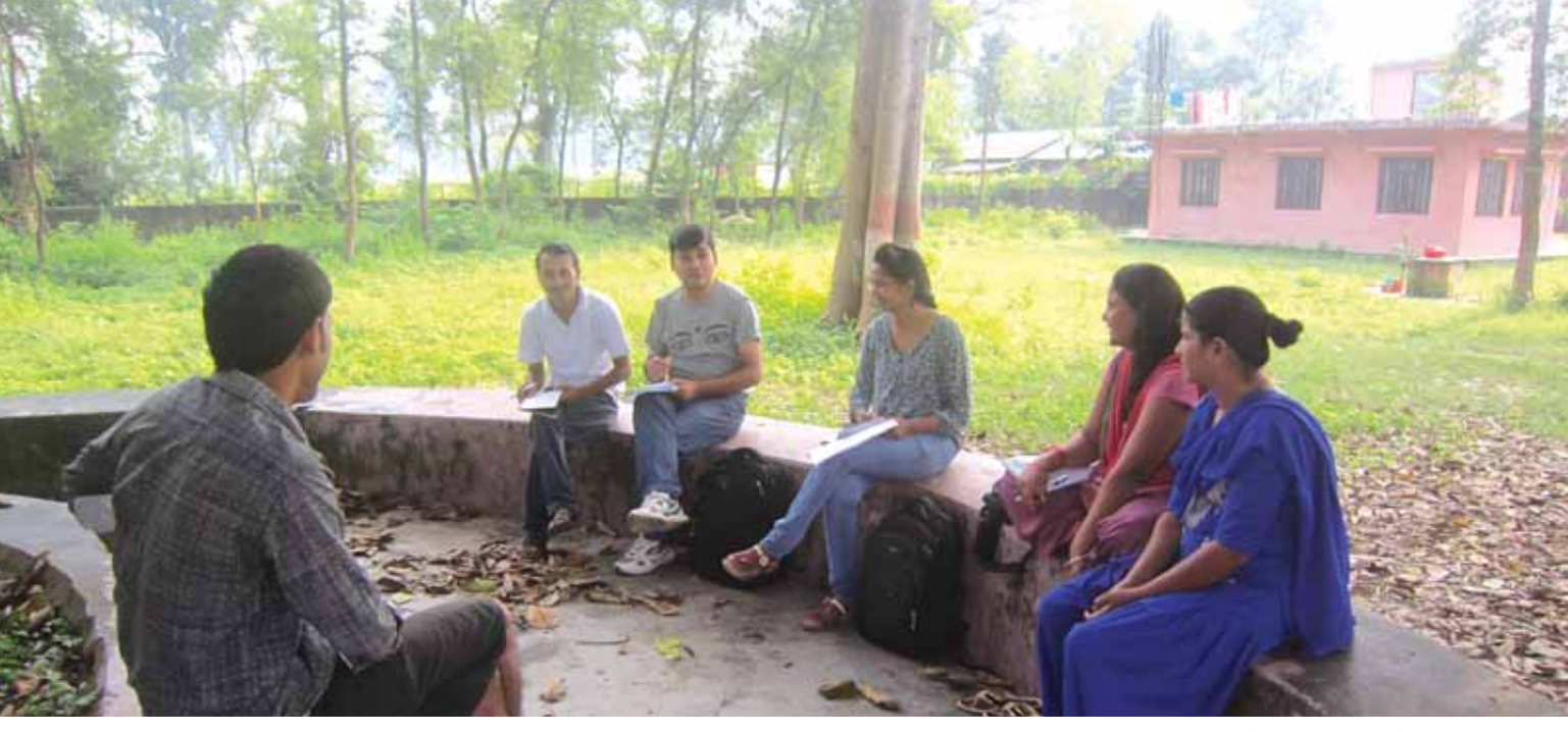
Interaction with local people in Banke