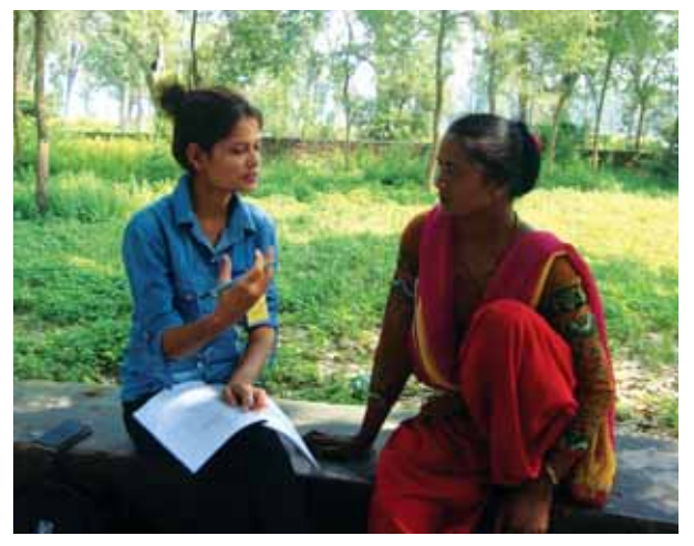
Interviewing local woman

The overall objective of this survey is to track the expenditure of block grants at the DDC and VDC level; CA Fund (constituent area development fund and constituent area infrastructure specific fund). However the specific objectives of this survey are: to develop a robust and accurate understanding of how and why selected funds (i.e. DDC/VDC block grants and Constituent Assembly development funds) flow from their point-of-origin to final expenditure; and to build the capacity of the SB's district NGO (DNGO) partners to independently conduct PETs activities at the VDC and district level.