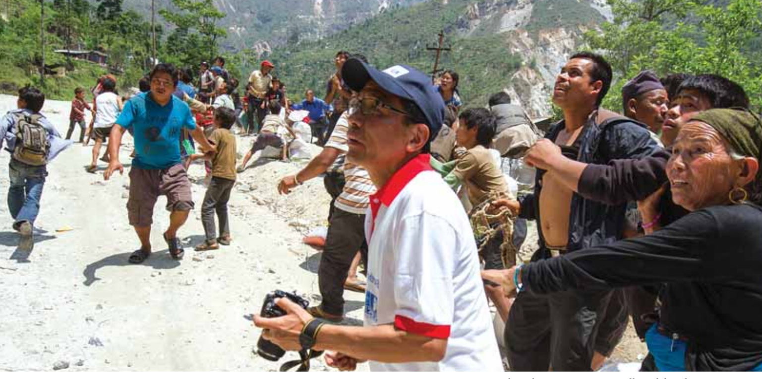
Earthquake on May 12 in Sindhupalchowk